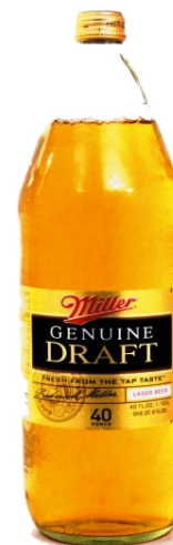
MGD 40-oz bottle