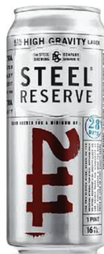
Steele Reserve 24-oz can