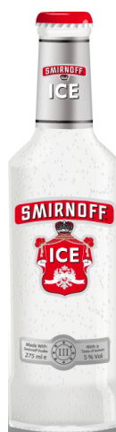
Smirnoff Ice 32-oz bottle