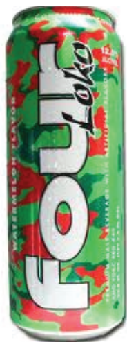
Four Loko 23.5-oz can