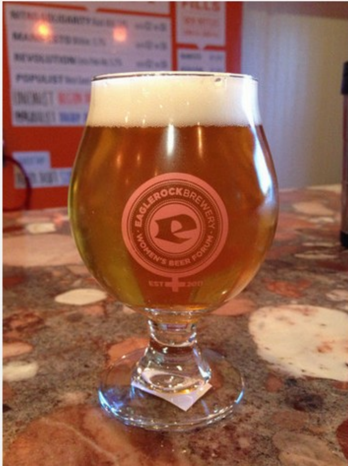
Eagle Rock Brewery is helping raise funds for breast cancer education with a special event Oct. 16 that will feature a number of pink beers.